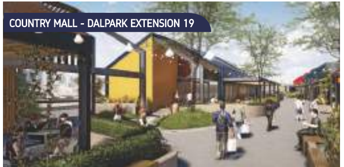
COUNTRY MALL - DALPARK EXTENSION 19