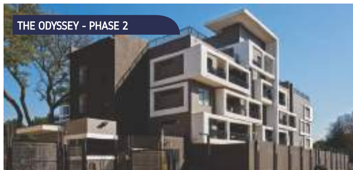
THE ODYSSEY - PHASE 2