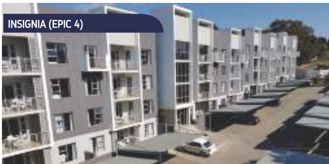
INSIGNIA (EPIC 4)