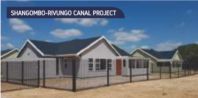
SHANGOMBO-RIVUNGO CANAL PROJECT