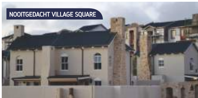
NOOITGEDACHT VILLAGE SQUARE