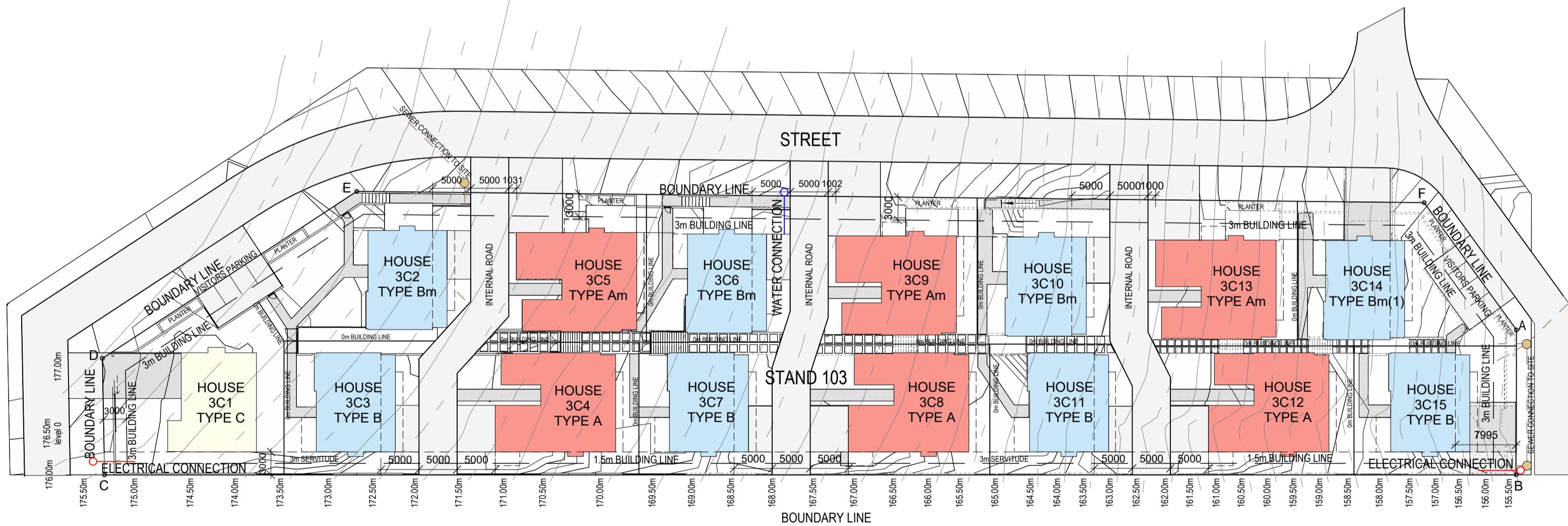
SITE PLAN Scale 1 : 500